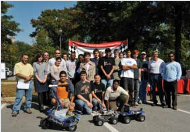
THE AUTONOMOUS ROBOT SPEEDWAY COMPETITION, OCT. 24

The Robotics@Maryland ground team placed second in the first annual Autonomous Robot Speedway Competition hosted by the University